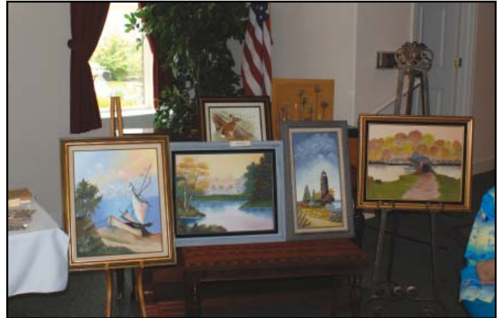
Residents' paintings stand together. More than 16 people displayed their work during the hobby show.