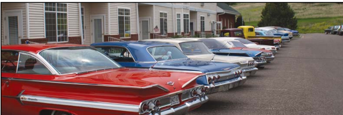
More than 25 cars lined the Waterford parking lot.